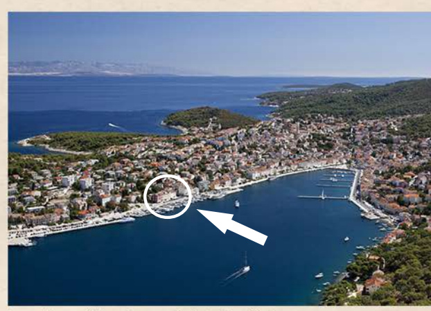
Location of the house in Mali Lošinj

The house has Wi-Fi and a computer is available in office in Veli Lošinj. You can use it any time during the opening hours. In addition, some bars and restaurants in Mali and Veli Lošinj offer Wi-Fi access for their guests.